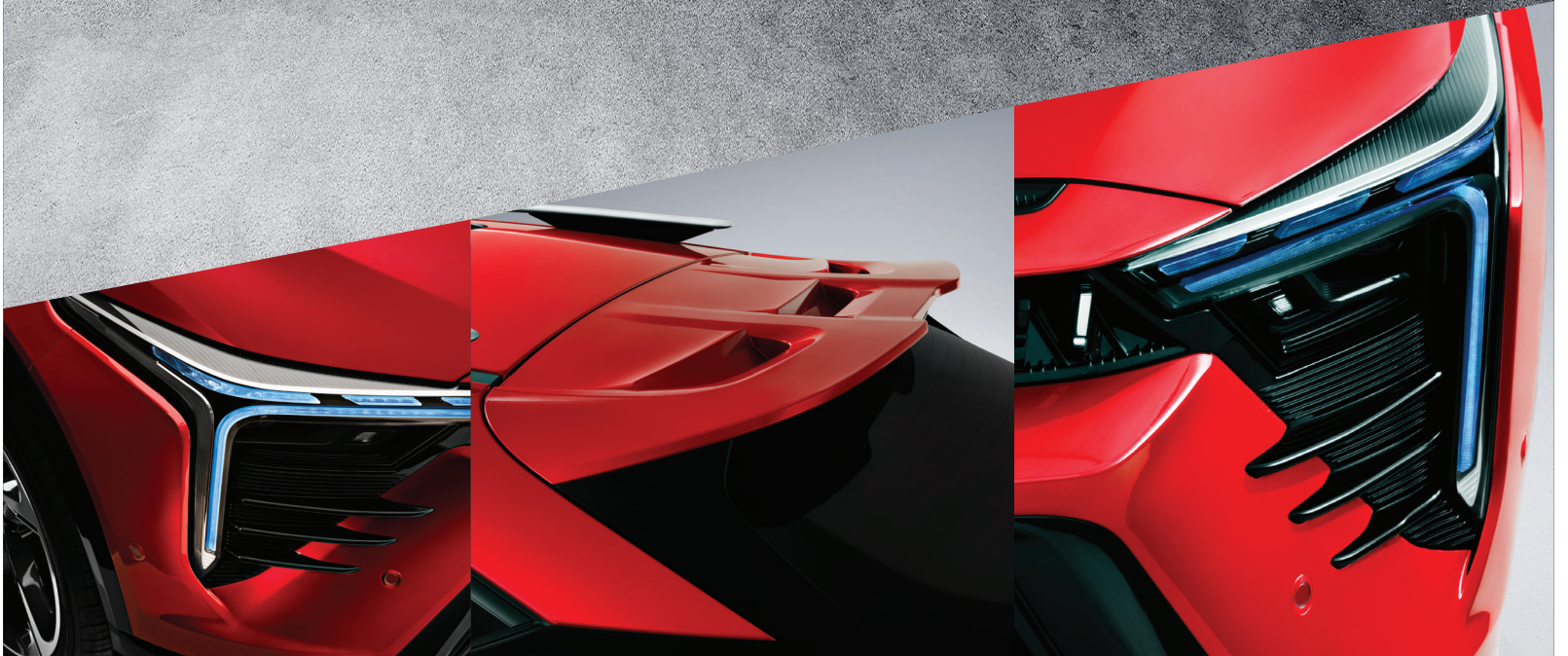
Dagger-axe type 2.0 split headlight مصباح أمامي من نوع Dagger-axe 2.0